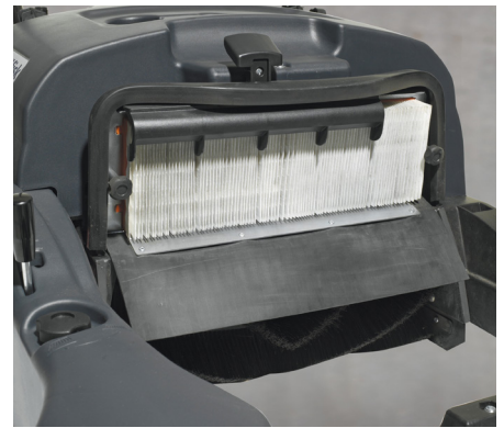
Thanks to the polyester filter the SW 750 can be used in both dry and humid areas.