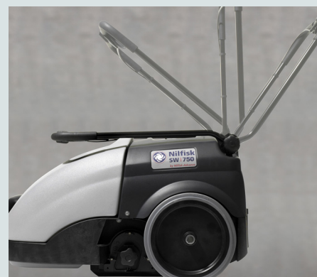
The handle is fully adjustable to suit each individual operator. It folds down completely to simplify storage.