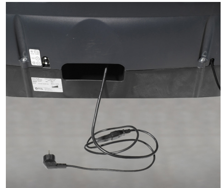
The plug-in onboard battery charger ensures continuous and hassle-free operation.